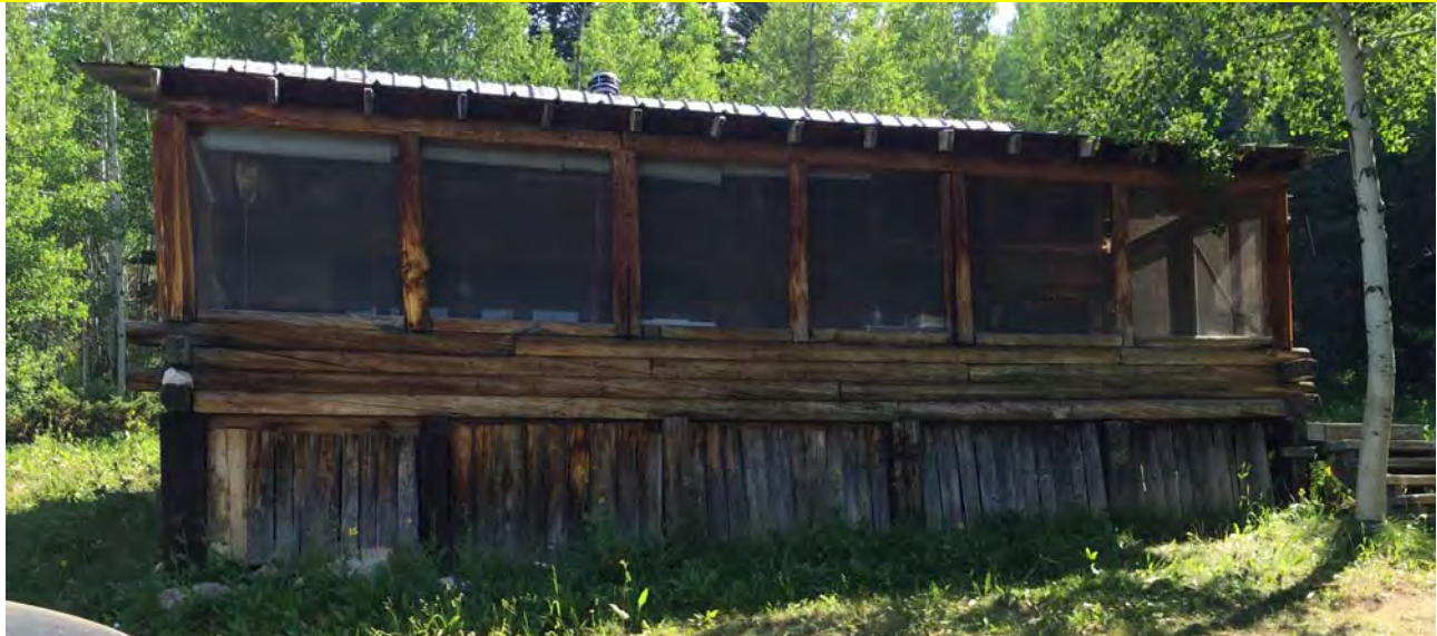
Weathered unsealed siding with cracks and crevices that will trap embers, and allow entry of flames.

You can now keep up on daily news and events with Bighorn Basin Firewise. Go to: https://www.facebook.com/bighornbasin.firewise